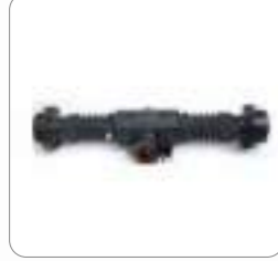
World Famous Carraro (Italy) Axle